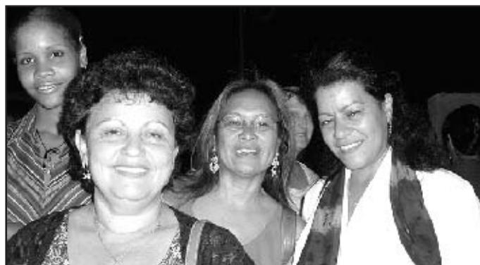
The author, third from left , with members of the Federation of Cuban women during a July 26 event several years ago commemorating the attack on the Moncada Barracks. This is a national holiday in Cuba. Above, left: View from the Malecon (the seawall) in Havana.

Continuance of the Bush doctrine towards Cuba is also reflected in Obama's budget request for fiscal year 2011, which includes $20 million to "continue to promote self determined democracy in Cuba...funds to be used to provide humanitarian assistance to political prisoners, their families and other victims of repression; advance human rights, strengthen independent civil society organizations; and support information sharing into and out of Cuba." These programs were part of Bush's program for "regime