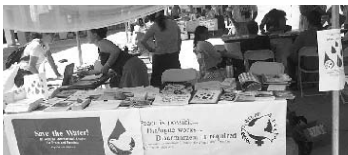
WILPF's water table was a popular spot for sharing information.

At the 2007 U.S. Social Forum, WILPF members were busy and active on many fronts, including the closing plenary on nuclear threat and weapons on space.