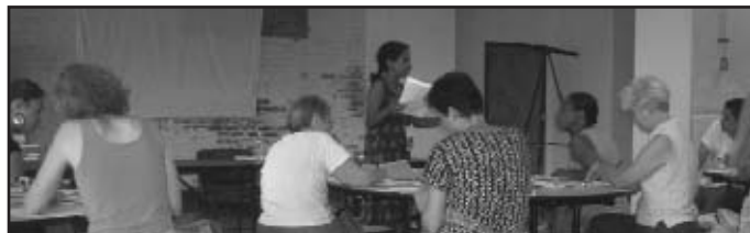
ABOVE: Coordinated Strategy to Prevent War workshop co-sponsored with WAND.