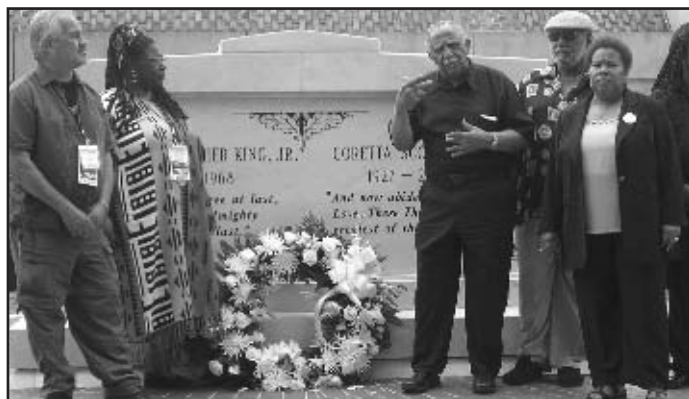
Speakers at Opening Ceremony honor Dr. Martin Luther King, Jr.