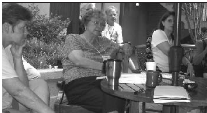
WILPF members gathered for breakfast and morning briefings in the hotel courtyard.