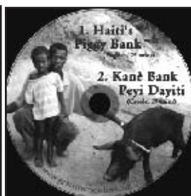
Resources from Green Valley Media