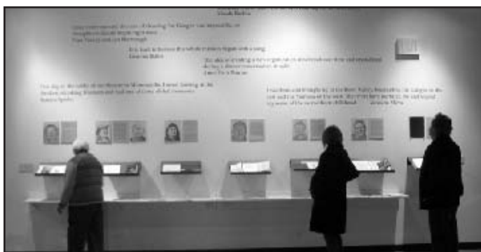
The inspiring Water Wall featured women and the organizations they founded to address water rights around the world.

The exhibition opened to the public amidst celebration, and a month-long schedule of events. This project has a long genesis rooted in thoughtful and ambitious organi-