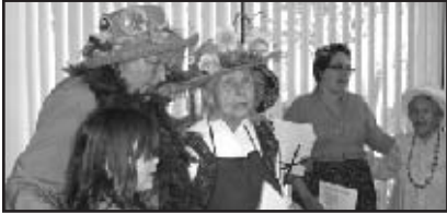
San Jose Raging Grannies help the branch celebrate its 94th birthday with a special skit.